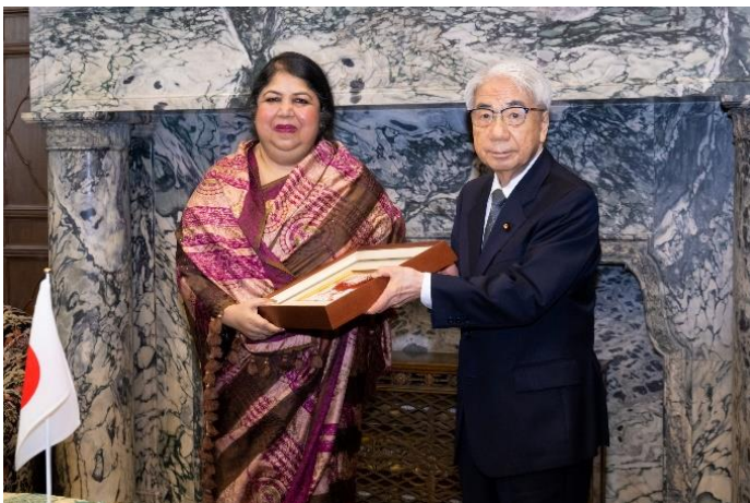
Meeting with Mr. Otsuji, Hon'ble President of House of Councillors

members welcomed her with applause. The delegation also met with Mr. Otsuji, Hon'ble President of House of Councilors on the same day. During the meeting, the Hon'ble speaker said that under the leadership of Prime Minister Sheikh Hasina, poverty alleviation, women's empowerment, implementation of social safety net programs, 100% electrification, allowance of lactating mothers, implementation of one house and one farm project etc. have been successfully completed in Bangladesh. Japan has a leading role in the development of Bangladesh. Japan can invest more in the economic zones of Bangladesh. Both countries can work together on gender discrimination, climate change etc. Meanwhile, the speaker emphasized strengthening the parliamentary relations between the two countries. Praising Dr. Shirin Sharmin Chowdhury as the first female speaker, President Hidehisa Otsuji said that Bangladesh has set a bright example in empowering women. The friendly relations between the two countries have been further strengthened by the recent visit of Hon'ble Prime Minister Sheikh Hasina to Japan.