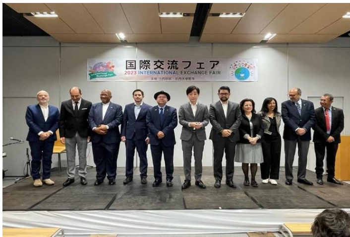
The Embassy of Bangladesh participated at the 2023 International Exchange Fair in Tokyo

many as twelve Embassies and diplomatic missions located within Chiyoda city joined this daylong event.