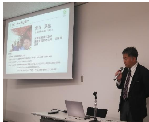
Embassy of Bangladesh, Tokyo, organized a Business Seminar and Networking Event