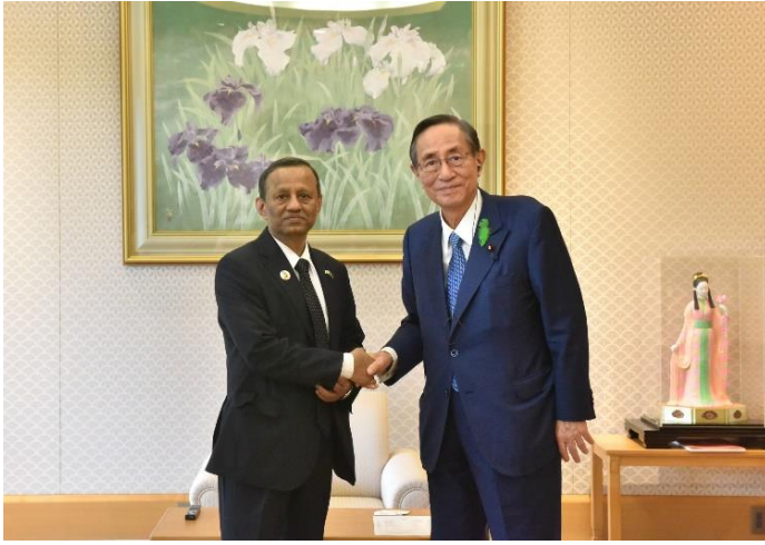
H.E. Ambassador Shahabuddin Ahmed paid a courtesy call on the Hon'ble Speaker HOSODA Hiroyuki, House of Representatives of Japan