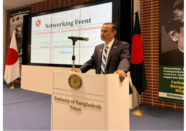
The Embassy of Bangladesh, Tokyo organized at a Networking Event on “Promoting Bangladesh- Japan Business Opportunities.”

Published by Bangladesh Embassy, Tokyo 3-29, Kioicho, Chiyoda-ku Tokyo 102-0094, Japan Email: bdembassy.tokyo@mofa.gov.bd