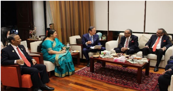
Bangladesh Parliamentary delegation attended a dinner hosted by H.E the Ambassador