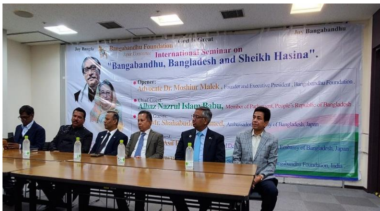
Bangabandhu Foundation organized a seminar in Tokyo