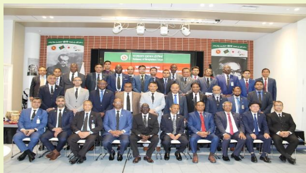
Ambassador Shahabuddin Ahmed with NDC delegation at Bangladesh Embassy in Tokyo.

NDC delegation visited Japan from 24-30 September 2023 as part of their overseas study tour. The delegation was comprised of senior members of the Armed Forces and Civil Servants from Bangladesh and included foreign participants from Sri Lanka, Indonesia, Mali, Niger, Nigeria, Saudi Arabia, South Sudan, Tanzania, and Zambia.