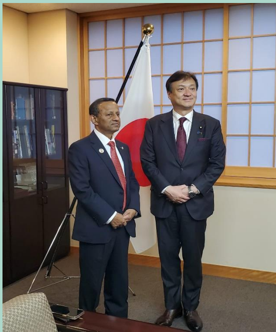
Ambassador Shahabuddin Ahmed made a courtesy call on State Minister for Foreign Affairs of Japan HORII Iwao

Ambassador Ahmed hoped that he would again visit Bangladesh at a mutually convenient time.