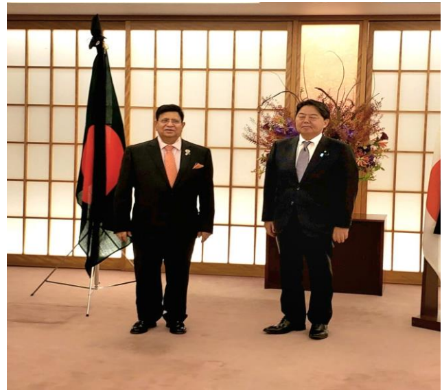
The Hon'ble Foreign Minister H.E Dr. A.K. Abdul Momen, MP, held a bilateral meeting with H.E. Mr. HAYASHI Yoshimasa, the Minister for Foreign Affairs of Japan at the Foreign Ministry in Tokyo