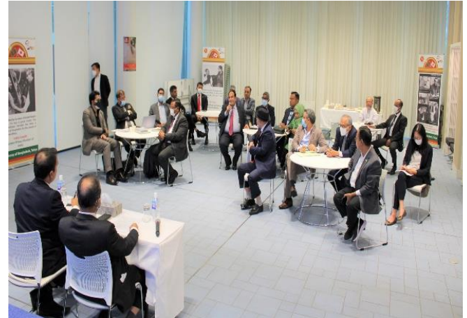
Embassy of Bangladesh organized a Networking Event with Bangladesh Business Delegates in collaboration with UNIDO ITPO