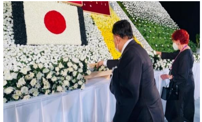
H.E Dr. A.K. Abdul Momen, MP, Hon’ble Foreign Minister of Bangladesh attended the State Funeral for the former Prime Minister ABE Shinzo in Tokyo.

Hosoda, Hon’ble Speaker of the House of Representatives; Mr. Hidehisa Otsuji, Hon’ble speaker of the House of Councilors; Mr. Saburo Tokura, Hon’ble Chief Justice of the Supreme Court; and finally former Prime Minister Yoshihide Suga as a representative of Abe’s closest colleagues. This segment was followed by paying respect of imperial envoys at the altar on behalf of Their Majesties the Emperor Naruhito and Empress Masako as well as other members of the Imperial family., Emperor Emeritus Akihito and Empress Emerita Michiko. Foreign dignitaries including Bangladesh delegation led by the Hon’ble Foreign Minister also placed floral wreaths at the altar. Finally, the ceremony ended with the sending off Abe’s remains.