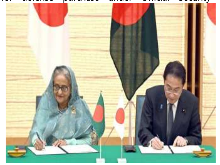
Signing and declaring Joint Statement

Assistance (OSA), economic cooperation with the pledge of announcing 30 billion yen, joint study of the Economic Partnership Agreement (EPA), Biman resumption of direct flight between Narita and Dhaka, and the establishment of the friendship city relations between Naruto city in Tokushima and Narayanganj city and the start of local tests for the Specified Skilled Worker (SSW) system in Bangladesh.