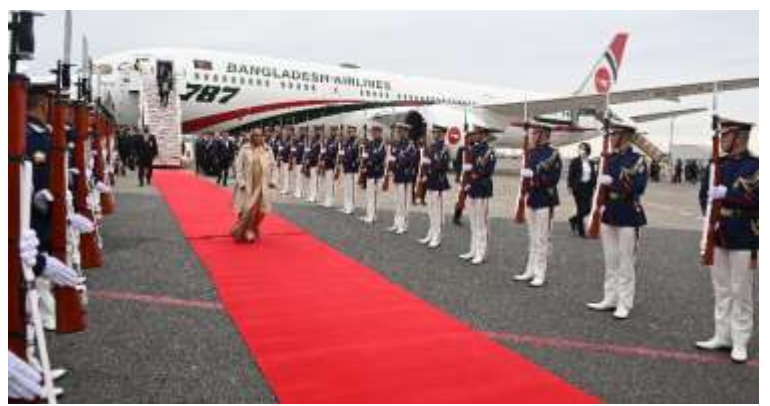
A red-carpet reception was laid down at the tarmac of the VIP area at Haneda International Airport