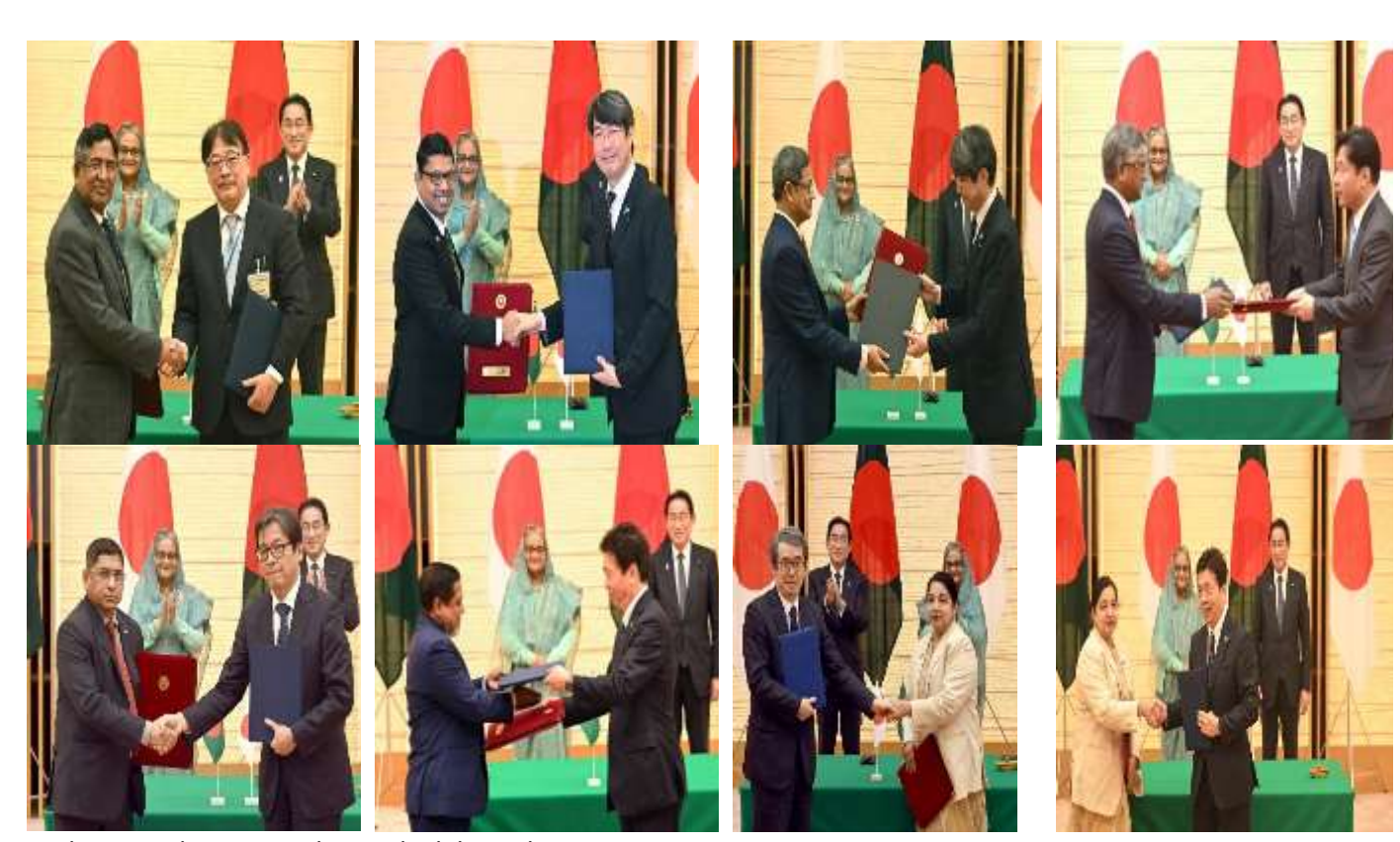
Exchanging documents during the bilateral meeting