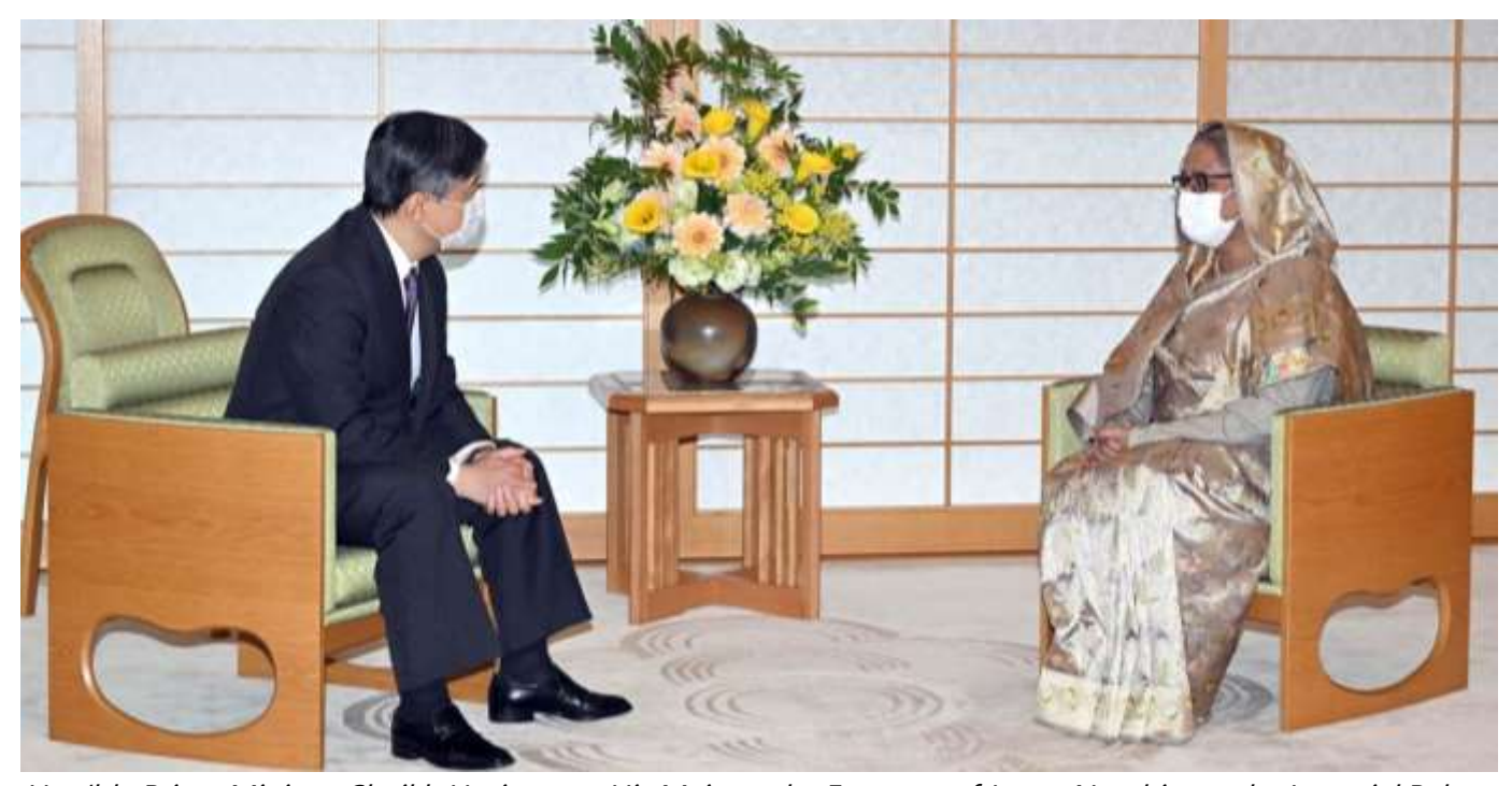
Hon'ble Prime Minister Sheikh Hasina met His Majesty the Emperor of Japan Naruhito at the Imperial Palace in Tokyo on 26 April 2023

Government level meeting with the Emperor arranged after the pandemic. This was an exclusive one-to-one meeting. The Emperor welcomed the Hon'ble Prime Minister. As reported when the Prime Minister expressed her gratitude for the support from Japan, such as the provision of vaccines during the COVID-19 pandemic, the Emperor said that the relationship between the two countries was rising.