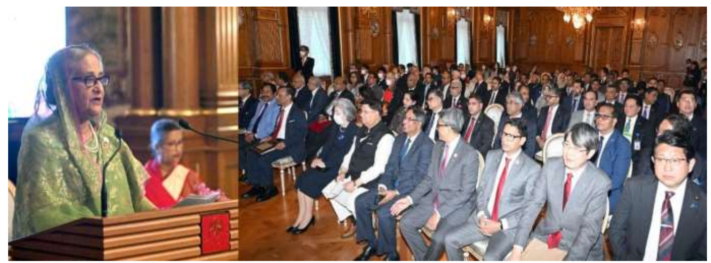
Honorable Prime Minister conferred "Friends of Liberation War Honour" to four Japanese eminent persons

the liberation war of Bangladesh. The "Honours" were handed over by the HPM at a solemn ceremony organized by the Embassy on Thursday, 27 April 2023.