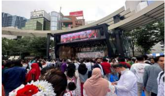
A segment of the participants