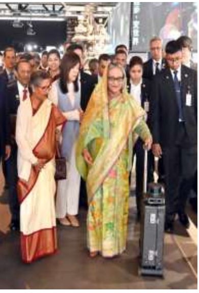
Honorable Prime Minister visited the National Museum of Emerging Science and Innovation (Miraikan)