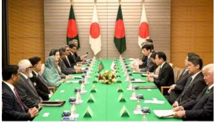
The bilateral talks between Hon'ble Prime Minister Sheikh Hasina and Fumio Kishida

Prime Minister Kishida covered issues following the content of the Joint Statement that the two leaders would sign after the Summit. He mentioned his new plan for Free and Open Indo-Pacific and said that support to Bangladesh would continue under the BIG-B initiative as well as the newly launched concept of Industrial Value Chain connecting the Bay of Bengal and neighboring regions, the defense cooperation including the MoU to be worked upon for defense purchase under Official Security