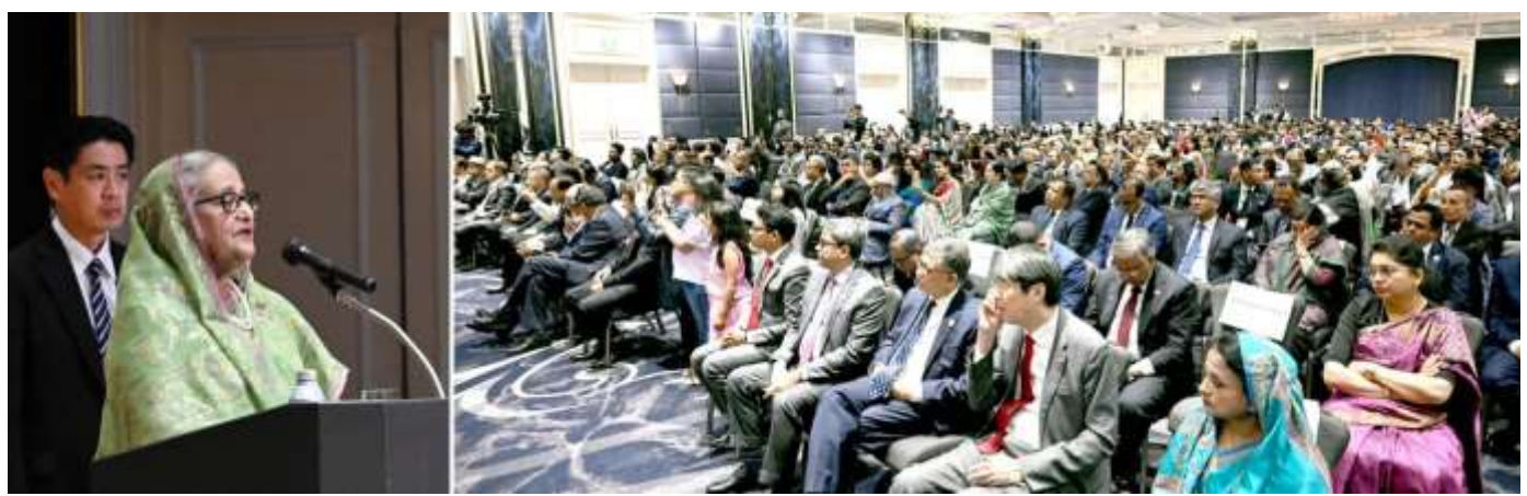
The Hon'ble Prime Minister attended a grand reception organized by the Embassy in cooperation with the expatriate Bangladeshis living in Japan