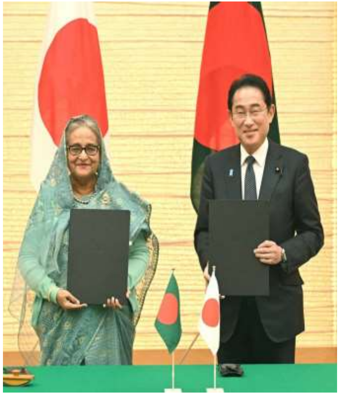
After Declaring Japan-Bangladesh Joint Statement on Strategic Partnership

Noting that the two countries celebrated the 50th anniversary of the establishment of diplomatic relations in 2022, as a manifestation of commitment and determination to contribute to enhancing the bilateral relationship based on common values and mutual interests, they decided to elevate the bilateral relationship to a "Strategic Partnership" as a guiding principle to lead the two countries' journey into the next 50 years and beyond.