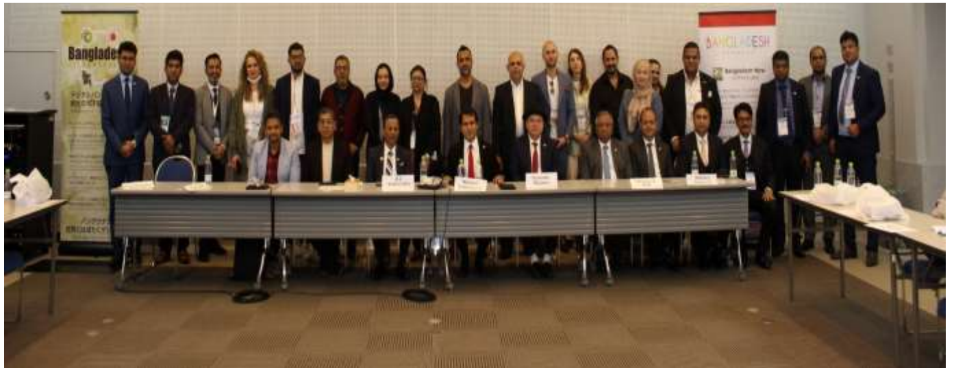
Fashion World Tokyo (FaW), Spring, 2023

all over the world, with around 600 exhibitors. Under the market development initiative of the Export Promotion Bureau (EPB), Ministry of Commerce, Bangladesh, 17 (seventeen) reputed exporters belonging to the apparel industry as well as leather goods are participated in this fair. H.E Ambassador along with other Embassy Officials visited Bangladeshi booths as well as NRB exhibitors. In the evening of the 1st day on 5th April, Embassy of Bangladesh, Tokyo organized Networking Event at Conference Tower of Tokyo Big Sight with the participation of Bangladeshi exhibitors at Fashion World Tokyo along with exhibitors at Japan IT Week, Japanese companies, NRB Exhibitors and invited guests from Japanese entities.