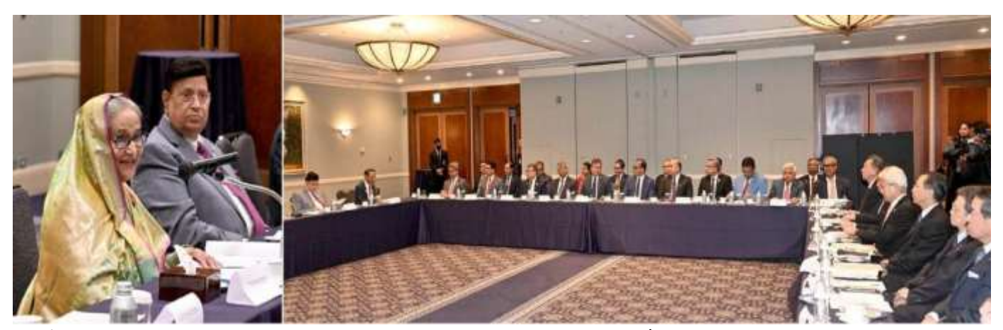
Hon'ble Prime Minister met the prominent trade and chambers President/Chairman like JBCCEC, JCCI, JETRO and President, CEOs and business leaders of Japan during Trade and Investment Summit held at hotel The Westin

encouraged them to do more business and investment in Bangladesh. She assured them of the sustained efforts put in by her government to make the conducive business environment in Bangladesh for the Japanese businessmen and investors. The Bangladesh Securities and Exchange Commission (BSEC) and Bangladesh Investment Development Authority (BIDA), in collaboration with the Japan External Trade Organization (JETRO) and The Japan-Bangladesh Committee for Commercial and Economic Co-operation (JBCCEC), jointly organized a Summit on "Trade & Investment Opportunities between Bangladesh and Japan" where more than 300 Japanese and Bangladeshi businessmen attended. A total 09 (nine) MoUs were signed between Bangladesh and Japanese companies, notable is Marubeni, Lion, Itochu, Sumitomo. JERA, MEDINA and Pipeline in diverse fields of manufacturing consumer goods, power and energy, IT, healthcare etc. There is progress in the Joint Study Group on the possibility of a Japan-Bangladesh Economic Partnership Agreement (EPA), the first meeting of which was held in April in Tokyo. The 5th PPED meeting has been held online in April 2023 and the next one is expected to be held in Tokyo soon.